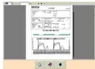
Generate a report